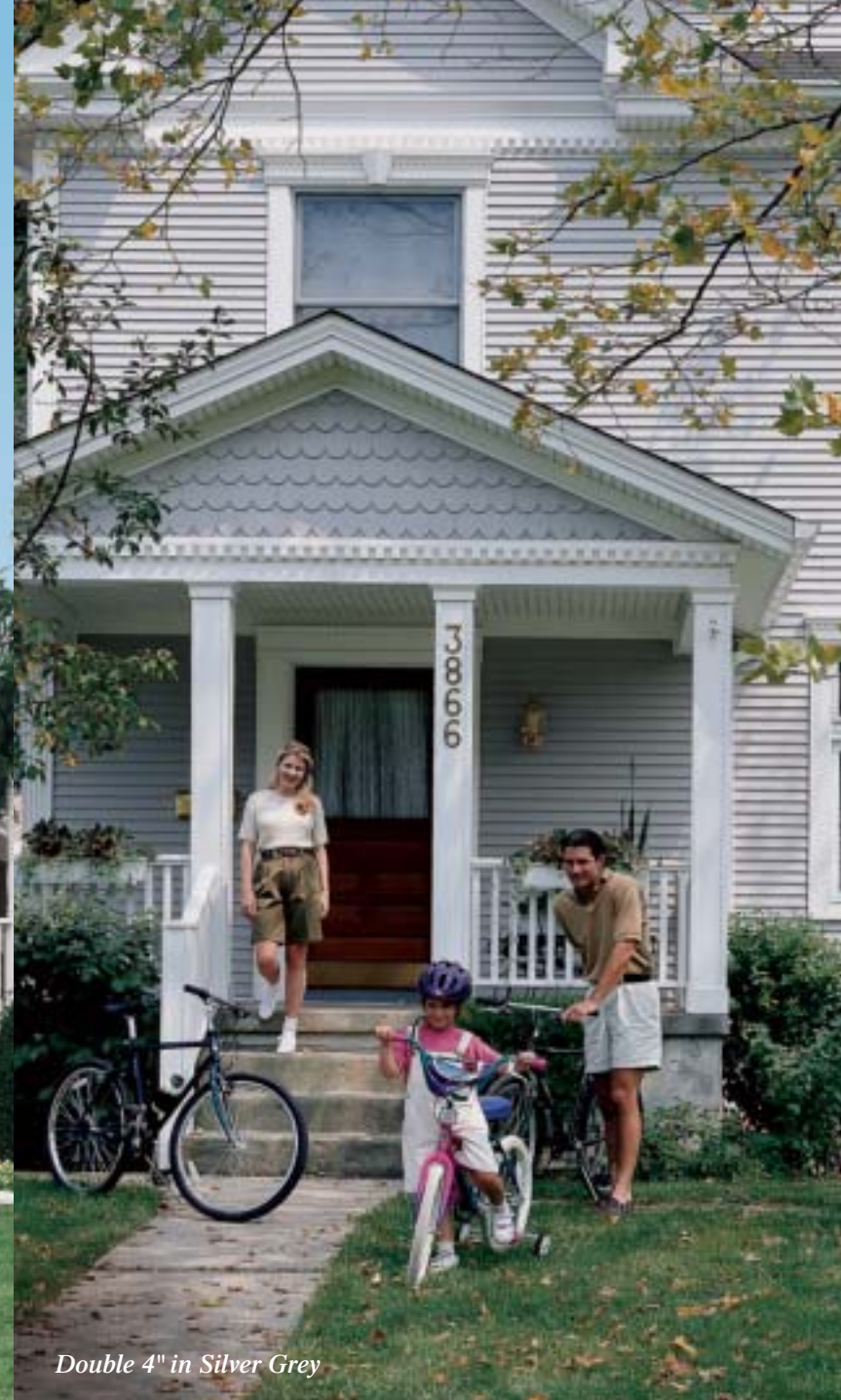
Double 4" in Silver Grey