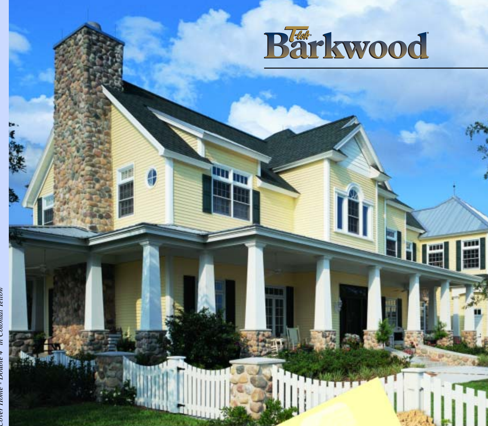
Cover Home - Double 4" in Colonial Yellow