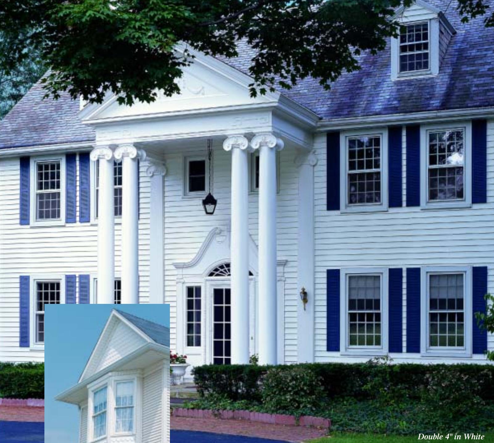
Double 4" in White