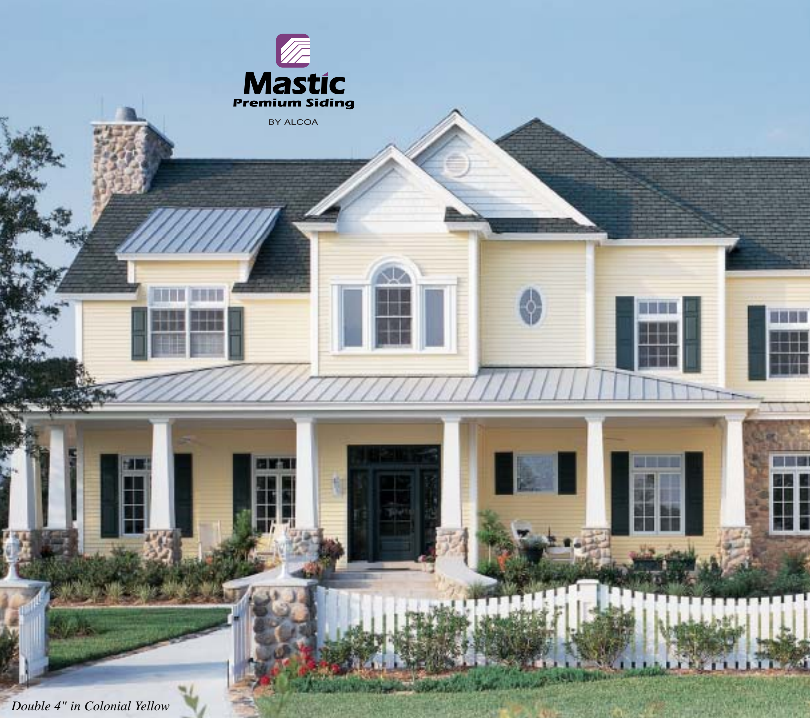
Double 4" in Colonial Yellow