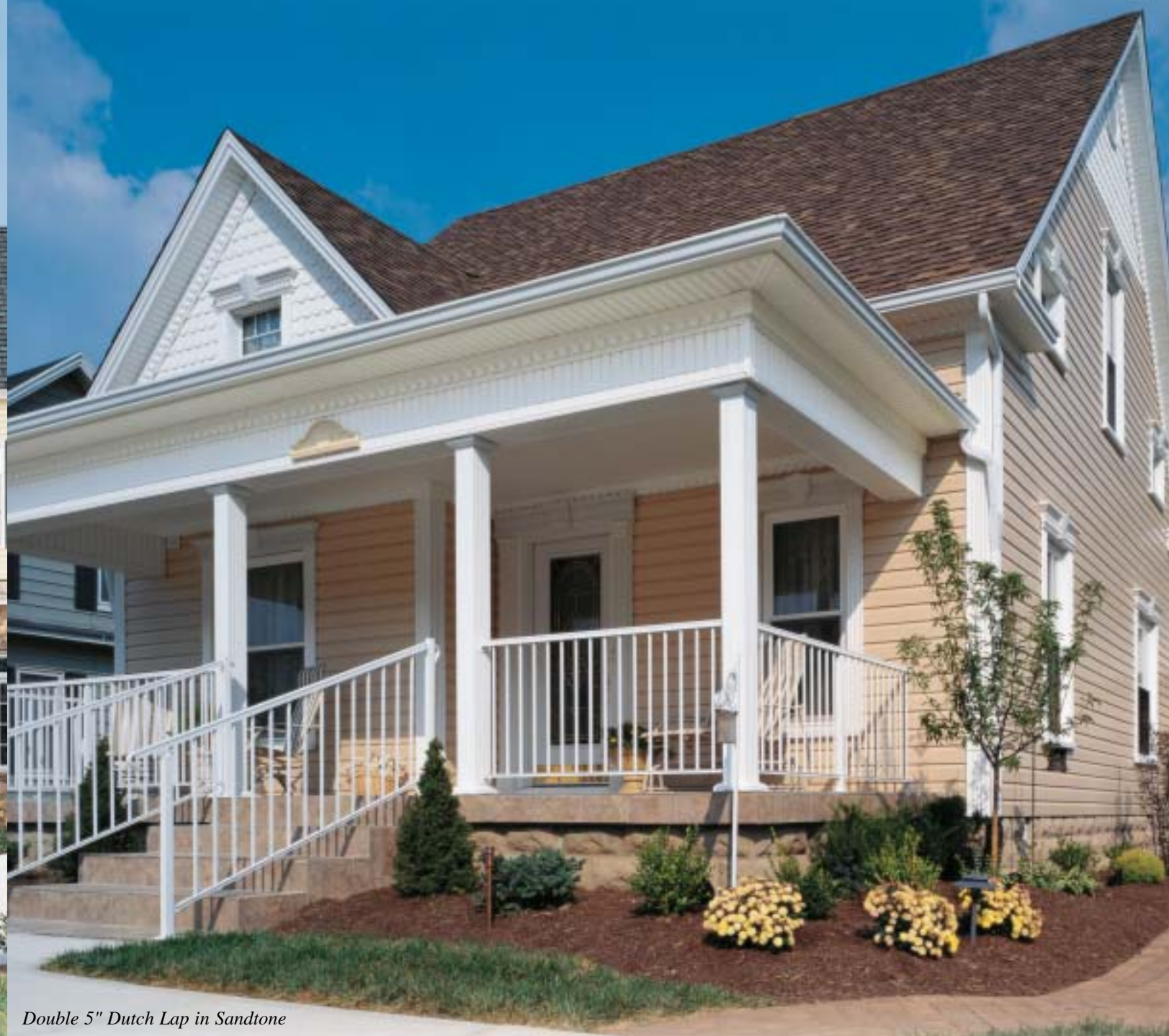
Double 5" Dutch Lap in Sandtone

From Main Street to State Street, virtually every city and town in America has a T-lok Barkwood home.