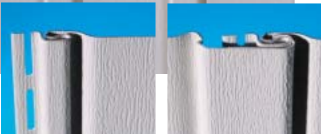
Features 6-1/4" board with 1-3/4" batten

Alcoa Home Exteriors has earned its steadfast reputation by constantly improving and evolving products and standards – exactly, what you'd expect from a division of Alcoa, Inc., the world's leader in aluminum production and fabrication and one of America's "Most Admired Companies" as rated by Fortune Magazine .