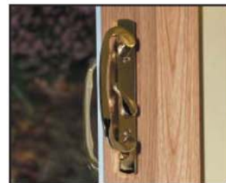
Deluxe Brass Tone Handle