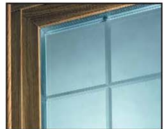
3M™ Accentrim® Grille