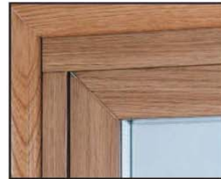
Medium Oak Vinyl Laminate